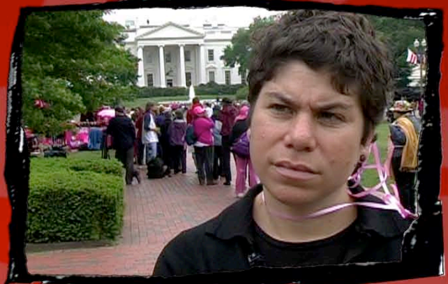
ANTONIA, IN STILL FROM SCALE, ALEXANDRA JUHASZ, 2007