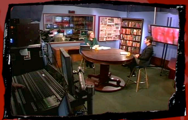
AMY GOODMAN AND ANTONIA, IN STILL FROM SCALE, ALEXANDRA JUHASZ, 2007