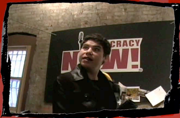
ANTONIA, IN STILL FROM SCALE, ALEXANDRA JUHASZ, 2007