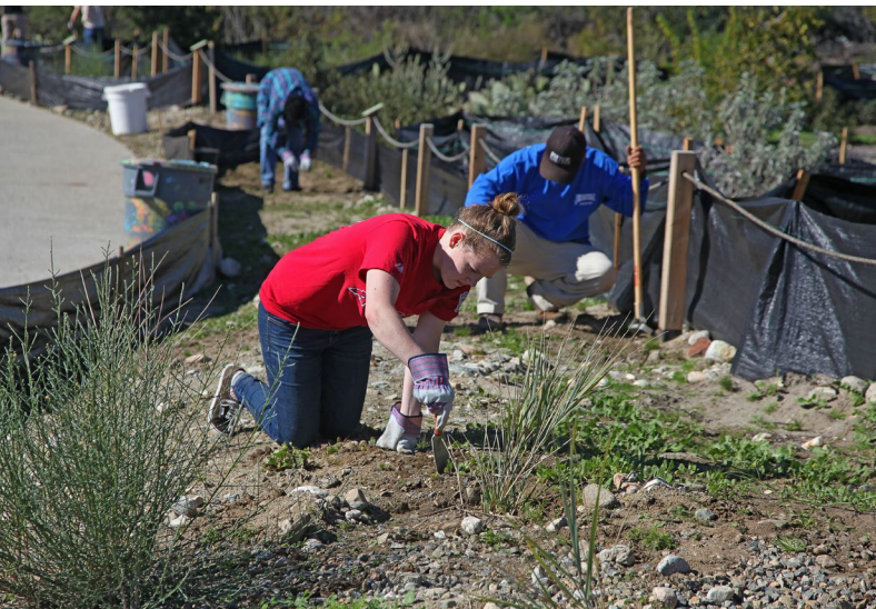
Students in "Restoring Nature: The Pitzer College Outback Preserve" have seeded and planted hundreds of native plants in our effort to restore ecological health to this small fragment of alluvial sage scrub.

and functionally and will demonstrate resilience to normal ranges of environmental stress and disturbance. It will interact as much as possible with regional ecosystems in terms of biotic and abiotic flows and cultural interactions. The small size and urban setting of the Pitzer Outback makes full ecological restoration impossible, so a standard must be set for achieving particular goals.