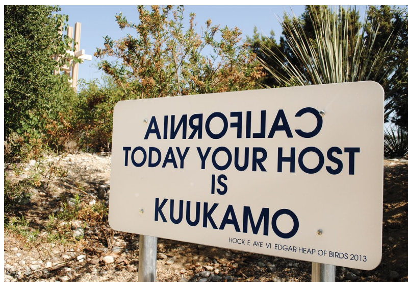
One of many signs on Pitzer's campus by the Cheyenne-Arapaho artist, Edgar Heap of Birds, which recognizes the local Tongva nation's presence, language and connection to the land.

The existence of these Indigenous nations and communities confronting and grappling with the many dimensions of colonialism creates incredible firsthand learning opportunities for Pitzer College students. More than this, however, it also creates opportunities for students to directly engage in disrupting both the legacies of past colonialism and elements of colonial domination that actively continue today. Towards those ends, since 2007 we and others at Pitzer have been working together to create various types of engagement between Pitzer students and Indigenous nations, communities and individuals. These efforts and engagements have included working on community projects with Tongva and Costanoan Rumsen Ohlone peoples, creating and running a summer Native Pipeline to