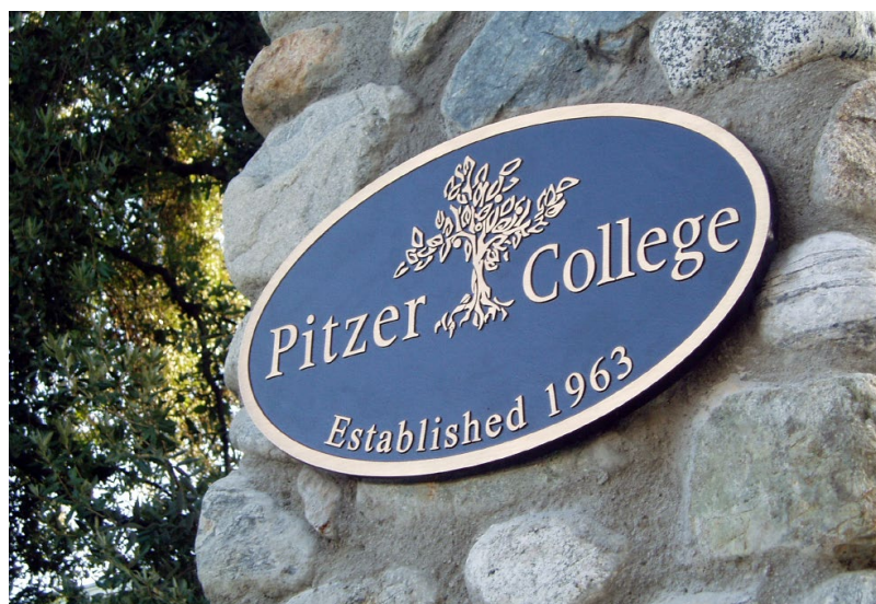
The Pitzer tree greets guests at the original entrance gates of the College.

As a general principal, the building of an effective institutional infrastructure for the support of community-based pedagogy in a liberal arts college must, of necessity, proceed from a deep understanding of the distinctive educational mission and organizational structure of the particular institution in which it is being developed. Because the educational value and vibrancy of engaged and effective community-based pedagogy is conspicuously and demonstrably evident in the work of students and faculty at institutions in which such pedagogical approaches are deeply embedded, it is tempting to believe that a “template” for such success can be identified in model colleges,