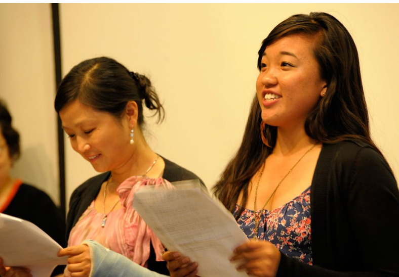
Students reading original poetry from joint class comprised of immigrant adult learners and Claremont College students. Public event with Literacy for All of Monterey Park (LAMP) at Bruggemeyer Library, Monterey Park, CA.