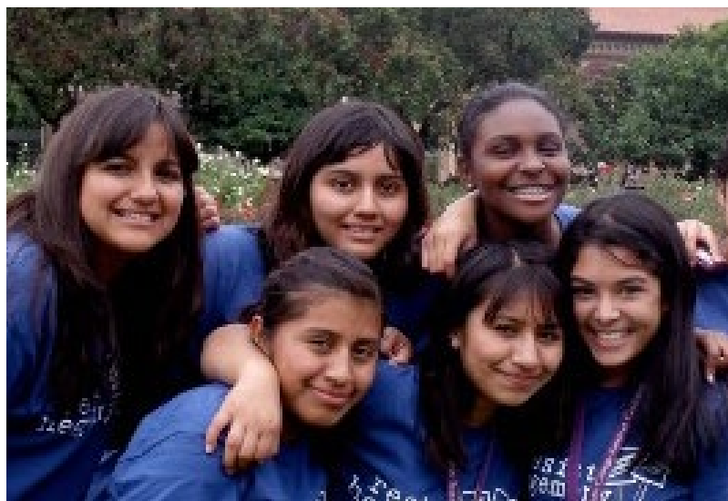
Scripps College Academy students enjoying a break in the Rose Garden on a field trip to the Los Angeles Science Center in Exposition Park, (2009).

My opportunity came in the form of a college access program at Scripps College. When faculty at Scripps invited me to help draft a residential summer program for young women, I was excited but unsure how chemistry fit the theme, “The Power of Ideas; Race, Class and Gender.” How was I to teach science within this rubric? I realized that I did not have to teach them science but, rather, how to gain access to the field. Socially constructed ideas about who does science limit access for women and people of color. I could use this program to show these young women real examples of minorities who do science and how they, too, can contribute to the field. This essay will describe my 11-year journey with the Scripps College Academy (SCA), how I have provided access to science for hundreds of young women and how they and the program have rewarded me in ways my science research never could.