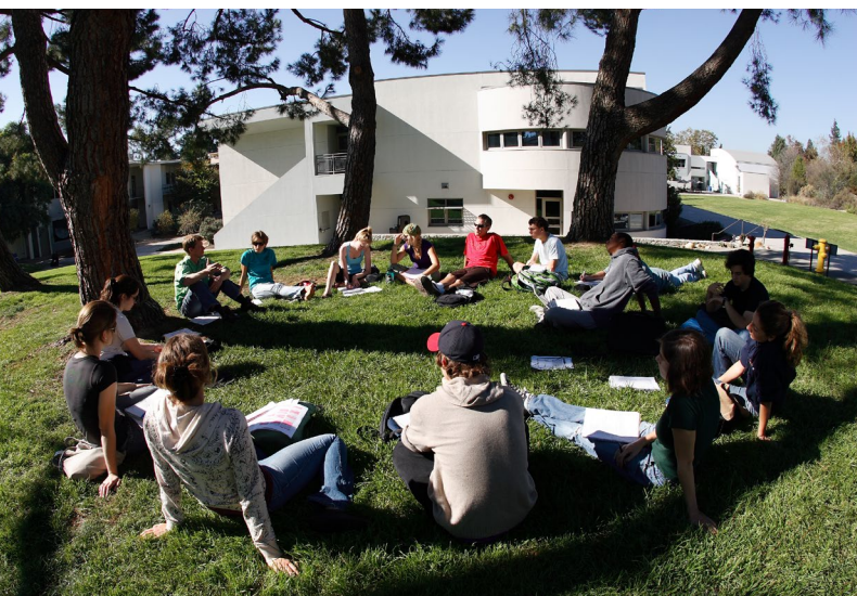
Demonstrating a decolonizing and Freireian pedagogical approach, it is not uncommon to see classes being held outdoors and in a circle.