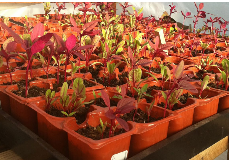
Swiss chard and amaranth seedlings in the greenhouse for garden plantings.