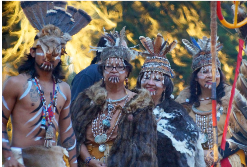
Members of the Costanoan Rumsen Carmel Tribe (Ohlone) in their traditional regalia, ready to start ceremony.

results that can be accomplished on externally generated grant/project timelines, and which address a discrete dimension under the control of researchers or “service-learners,” are more likely to find support. It is quite rare to have support for projects that are truly accountable to communities, work on their timelines, are responsive as events unfold in unanticipated ways, and address the interconnected elements of communities healing from centuries of multidimensional colonial wounds.