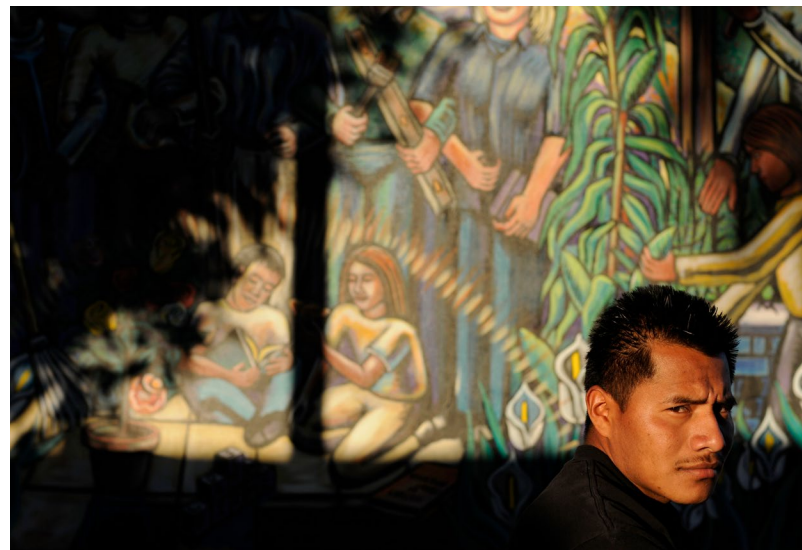
Day Laborer and portion of mural painted in collaboration with artist Paul Botello, Pitzer students, and day laborers at the Pomona Economic Opportunity Center.

Despite differences in legal citizenship, skin color, country of origin, religious affiliations, language and region, African Americans and Latinos, for example, share historical experiences where laws, social practices and race-based ideologies combined to create a caste-like society that benefited a few at the expense of the many. The systems of slavery and colonization served as tools to ensure the Western European elite's access to the raw materials and human labor found in Africa, Asia, Latin America and the Caribbean. These systems of slavery and colonization institutionalized a form of structural violence that used laws to ignore a group's basic human rights.