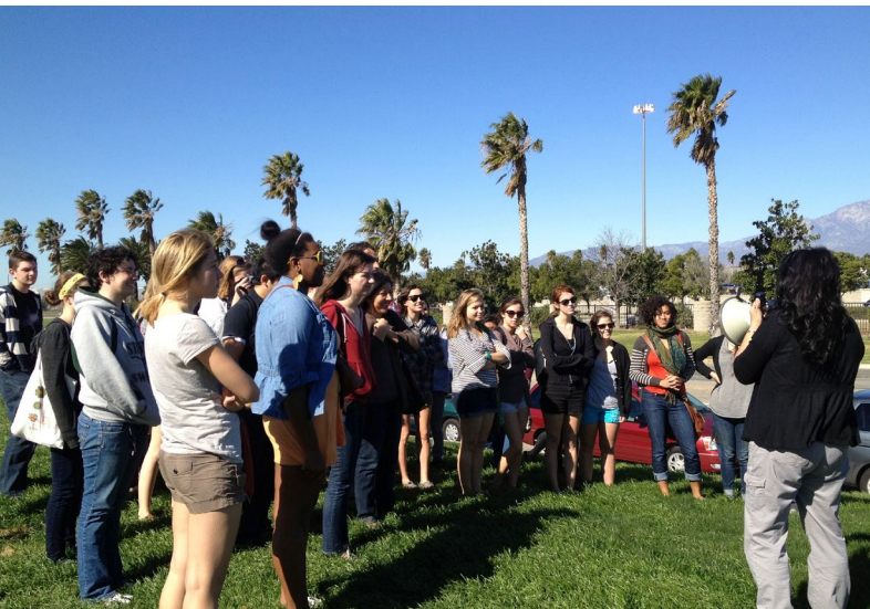
Toxics tour: Outside Jurupa Valley High School and adjacent to rail transfer yard.

in tune with the actual needs of communities, it is important that members have a voice in the decision-making process. Thus, building these relationships can also be a useful tool for organizers and supporters alike in helping shape policy that directly affect community members. Overall, I was really excited to learn so much from these women and about organizing in general.”