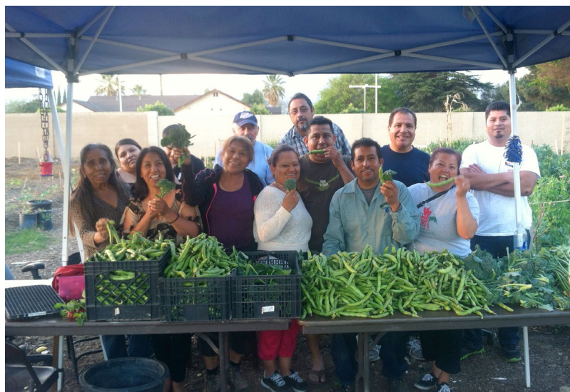
Huerta del Valle's first community harvest of winter crops in March 2014 included fava beans, broccoli, beets, turnips, spinach, lettuce, and carrots.

Huerta del Valle's success is inextricably tied to Pitzer's history and dedication to local community engagement. Engaging students in change-oriented work and teaching them to apply theory to practice are the signature goals of the Pitzer in Ontario program. Pitzer in Ontario is a semester-long, immersion-style program in which students take three courses and apply their academic learning to