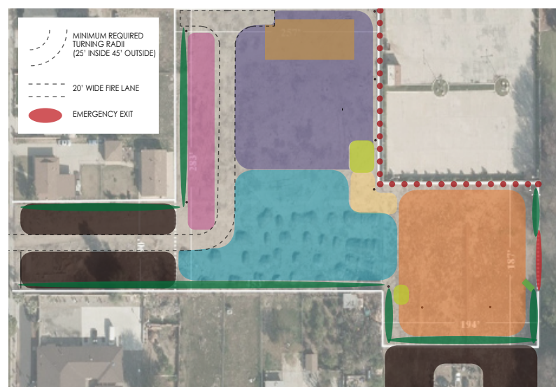
Map shows community garden area (orange), hands-on education area (blue), intensive production area (purple), and compost area (beige).

Our four program areas were decided in a collaborative, shared decision-making process with Pitzer faculty, students and community members led by HdV's community leader and executive director, Maria Teresa Alonso. We designed the programming areas to address particular community needs and to address particular challenges posed to quality of life, access to healthy food, safe clean environment and economic opportunity for low-income people in Ontario. All program areas are represented in the map below.