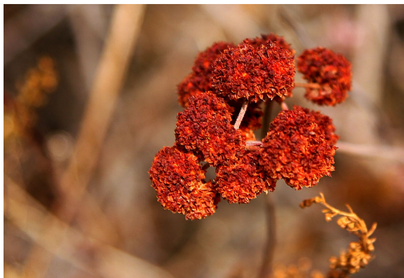
California Buckwheat ( Eriogonum fasciculatum ) flower clusters in their brown glory of summer and fall. The buds cluster in tight pinkish balls on long stalks that turn white when they open and as they dry they turn rust brown in the fall. Vast areas of California used to have Buckwheat covering the ground.

For the purpose of restoration, an ecosystem can be recognized in a spatial unit of any size, from a microsite containing only a few individuals to an area showing some degree of structural and taxonomic homogeneity, such as the “alluvial scrub