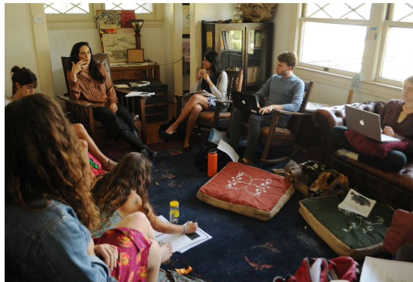
Breaking out of the mold of the traditional classroom, the “Healing Ourselves, Healing Our Communities” course is held in the Grove house.