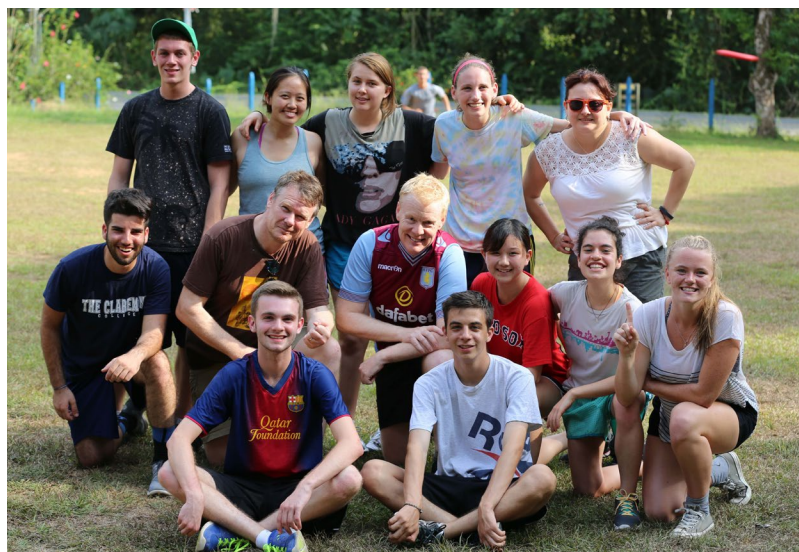
The Pitzer faculty, student and staff Global/Local Mentorship soccer team (which lost 5-1 to a local soccer team in Dominical, Costa Rica, March 20, 2014). All of these students will be undertaking study abroad on a Pitzer program during their sophomore year as part of the Global/Local Mentorship Project.

There are intellectual , pedagogic and institutional linkages that are central to IGLAS's mission. Intellectually, there is the relationship between global and local, in all its dimensions: for international political economy, the flows of products, finance and labor between all locals, including 909-land, and the global; for cultural studies, the flows of ideas, culture, music and memes; or for chemistry, the atmospheric pollutants that affect the Inland Empire and the world. In terms of action and study , there is the relationship between engaged and experiential learning and reflective, analytic study. The coupling of action and study, engagement and reflection also allows us to think about both students' intellectual and what the literature calls psychosocial development—the cognitive and the affective or the visceral—the traits of tenacity, overcoming adversity and grit, which all the evidence indicates is a better