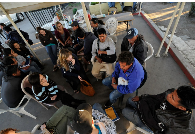
Pitzer students meeting with day laborers, as part of Rural and Urban Social Movements class, to develop collaborative engagement projects.

creating stories to their loved ones abroad as to why the relatives should not visit them. Ultimately, as a result of being caught in the lowest levels of the stratification structure with no way to get out, they lose all contact with their homeland. This was the case of many Filipino farm workers who grew old and, when it came time for them to retire, had no place to go. It was out of this reality that the United Farm Worker's union, with the help of many college students, constructed a retirement home, Agbayani Village, for the elderly Filipinos.