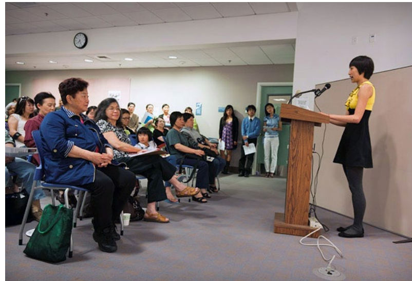
Audience listening to original poetry from joint class comprised of immigrant adult learners and Claremont College students. Public event with Literacy for All of Monterey Park (LAMP) at Bruggemeyer Library, Monterey Park, CA.

With the support of the Community Engagement Center at Pitzer College and the Weingart Foundation, I started a partnership between the Asian American Studies department and LAMP in the fall of 2009. With a commitment to using